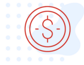
HAVE YOU SAVED MORE OR SPENT MORE MONEY THAN USUAL IN 2020?

McCrindle Research recently produced a report examining the impact of this year on savings capacity, and what Australians planned to do with those savings.